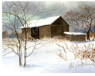
"First Snowfall-Barn" 95-26 6" x 8" $750