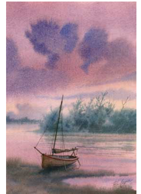
“After the Storm” watercolor (02-25) Image 7 1/2” x 11” Framed: 13” x 17” $450