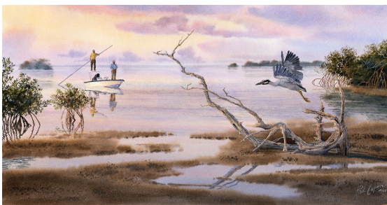
“Dawn on the Flats” watercolor (00-19) Image: 16 1/2” x 29” Framed 28” x 42” $6750