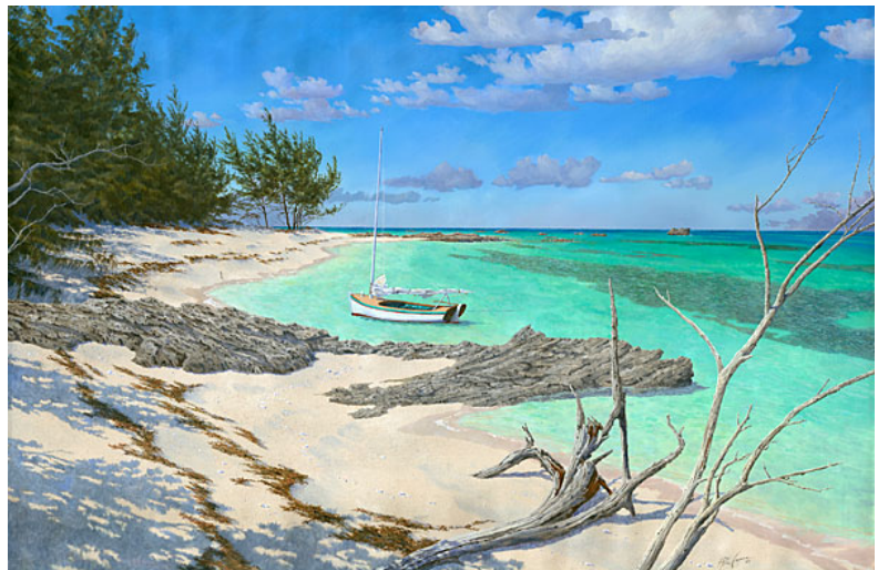
“An Island Far Away” oil (03-22) Image: 40” x 60” Framed: 48” x 68” $23,500