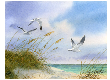
"Flight Over The Dunes" 96-42 7" x 9" $500