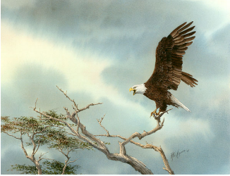
"American Bald Eagle" 89-04 13" x 17" $2250