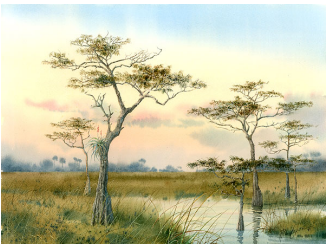
"Dwarf Cypress" 92-09 12' x 16" $2250