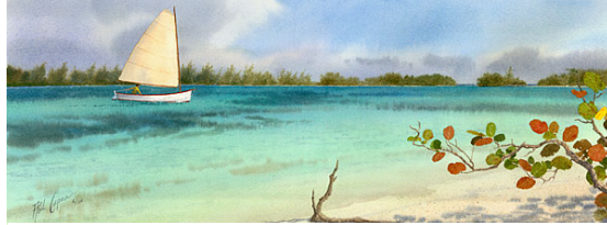
“Looking for a Beach” watercolor (02-3) Image: 8 1/4” x 21 1/4” Framed: 14” x 27” $825