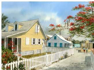
"Green Turtle Cay In June" 89-06 16" x 21" $3500