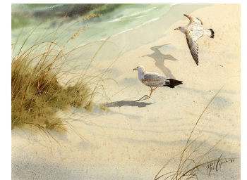
"Gulls On The Beach" 85-09 12" x 16" $1500