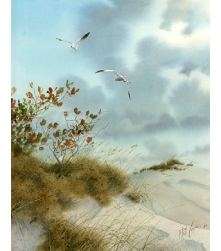
"Dunes And Seagrasses" 86-24 12" x 16" $950