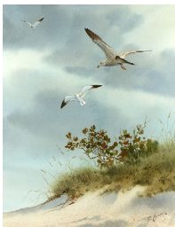
"Free Flight-Gulls" 88-08 12" x 16" $1200