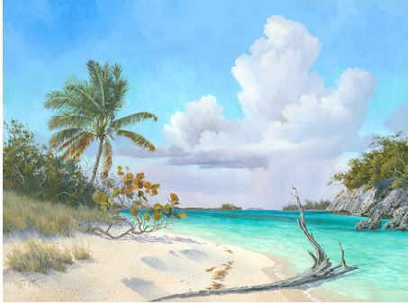
“A Beach in Abaco” oil (06-6) Image: 18” x 24” Framed: 26” x 32” $5750