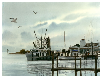
"Ocracoke Coast Guard Station" 86-66 16" x 21" $3500