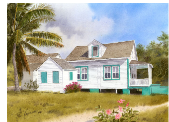
"Spanish Wells Cottage" 94-59 8" x 12" $1200