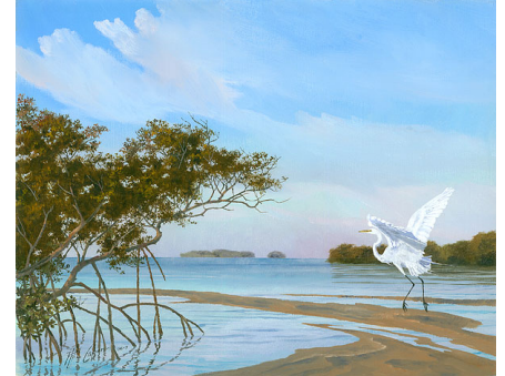
“Egret in the Mangroves” oil (06-7) Image: 11” x 14” Framed: 17” x 21” $1475