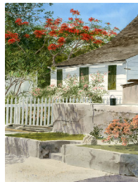
"Early Summer Hopetown" 87-54 16" x 21" $3000