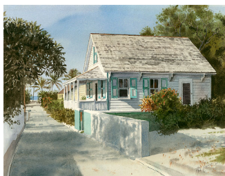
"New Plymouth Home" 85-33 12' x 16" $2000