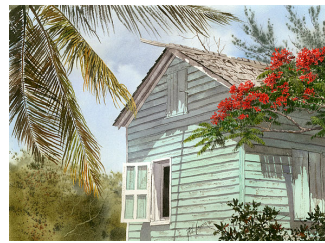
"Guana Cay" 90-25 12" x 16" $2000