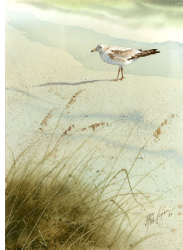
"Beachcomber-Gull" 86-42 8" x 11" $750