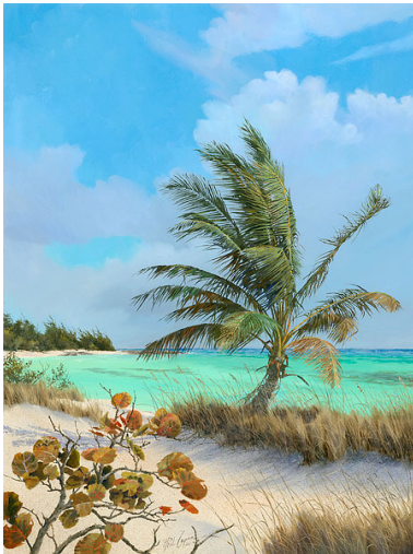
“Palm, Gillam Bay” oil (06-9) Image: 18” x 24” Framed: 26” x 32” $5750