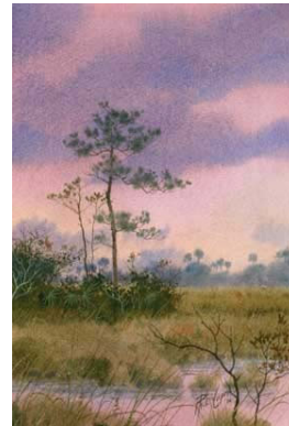
“Pine at Sunset” watercolor (02-26) Image: 7 1/2” x 11” Framed: 13” x 17” $450